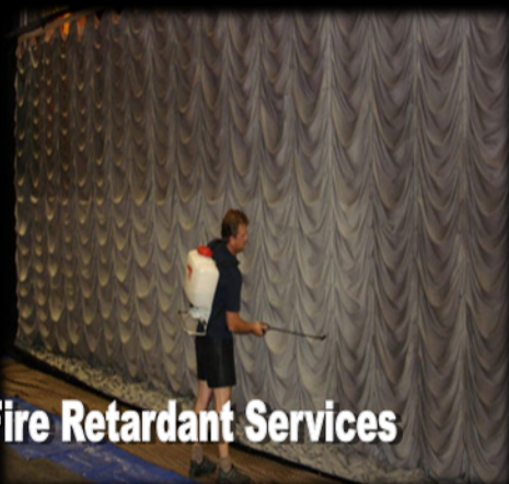
Fire Retardant Services

Our talented team can manufacture to your exact specification or help you design and create an amazing drape