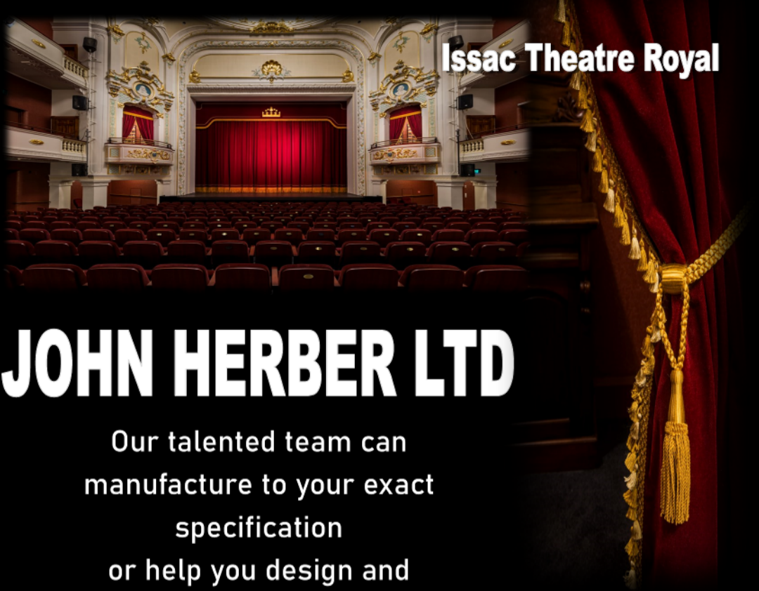
Issac Theatre Royal